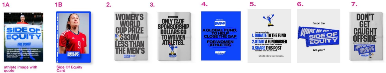
athlete image with quote